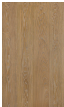
Subtle White (Grain Only)