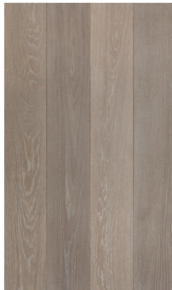
Light Smoked White