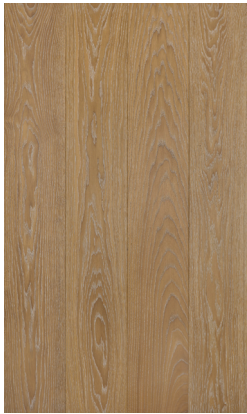
Subtle White (Grain Only)