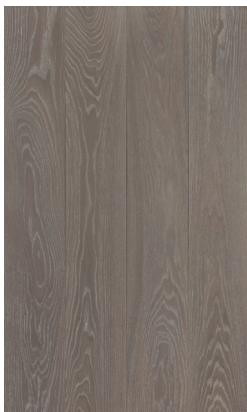
Dark Smoked (14HR) White