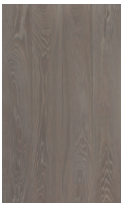
Dark Smoked (14HR) White