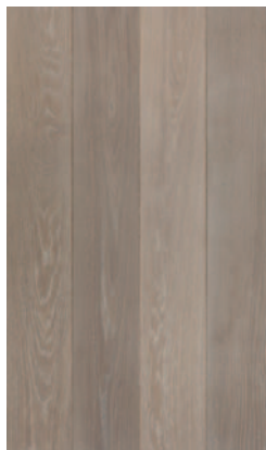
Light Smoked White