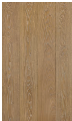
Subtle White (Grain Only)