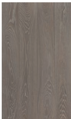
Dark Smoked (14HR) White