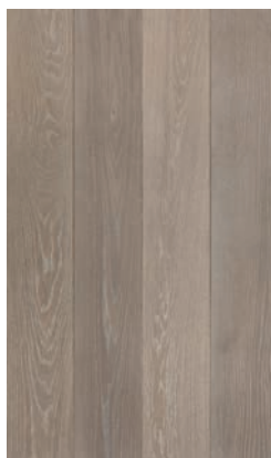
Light Smoked White